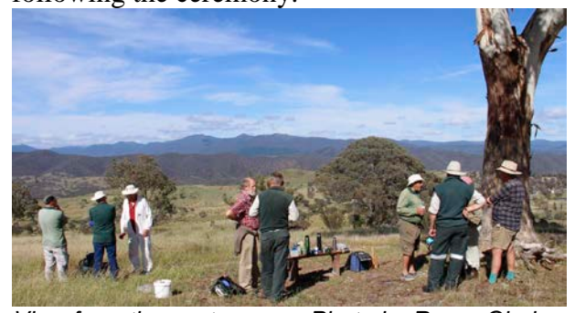
View from the seat

The monthly working party meeting began with a "bench-warming" occasion, when we invited the rangers and our members to celebrate the placement of a bench to mark the 25th Anniversary of Park Care in the ACT. This smart bench has been sited beneath a beautiful red-box tree, about halfway along the ridge, and enjoys stunning views west over the Murrumbidgee Valley and to the Brindabellas. Our ceremony was conducted as we enjoyed tea/coffee and snacks and watched the changing light of the rising sun. It was too early for champagne, and we didn't think we'd be popular if we smashed the bottle against the bench! Not to mention the effect on weeding skills following the ceremony.