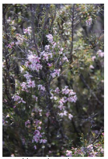
Lissanthe strigosa